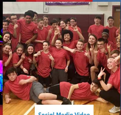
Social Media Video