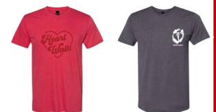
Heart Walk Heart Tee Red Heather Unisex Sizing

$1,000+ Top Walkers: Fundraising walkers who personally raise $1,000+ will receive special benefits such as access to our event day VIP area, special recognition at the event and chances to win exciting prizes!