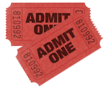
1 Additional Drink Ticket